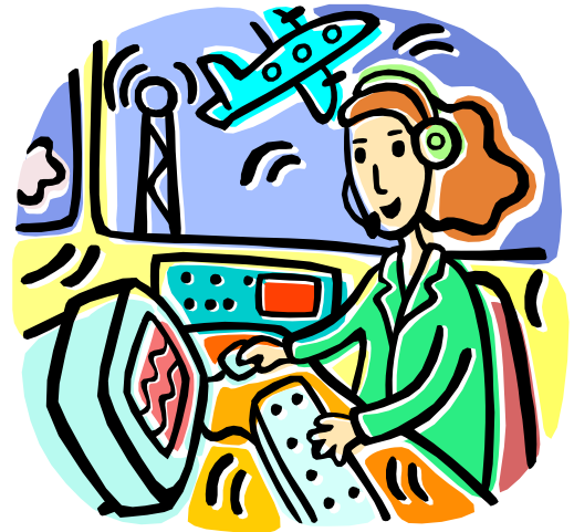
Current Monthly Wage Data (2010) from California Labor Market Information (LMI)